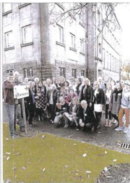
The students and their guests from Sweden and Romania at the college building in Arbroath.